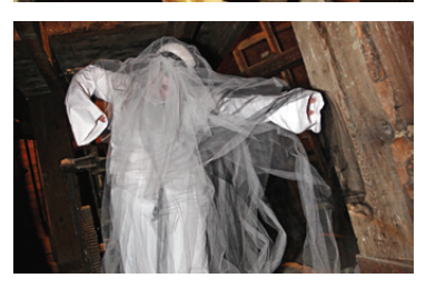
Ghost Tour and Birthday Celebration September 18, 2015 St. Mary's University